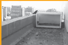
SJ City Hall 2008-06-12 17:57:50