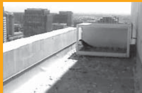
SJ City Hall 2008-06-17 15:19:54