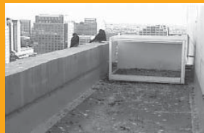
SJ City Hall 2008-06-12 19:06:14