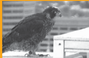
SJ City Hall 2008-06-31 07:33:02