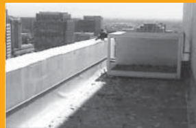
SJ City Hall 2008-06-17 15:21:35