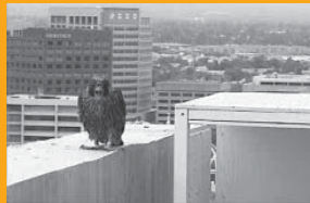
SJ City Hall 2008-05-31 07:28:00