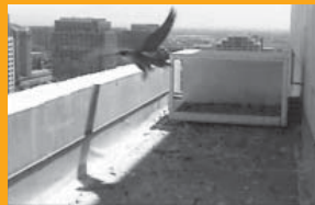
SJ City Hall 2008-06-17 15:20:46