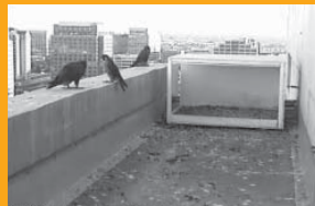
SJ City Hall 2008-06-12 19:38:09