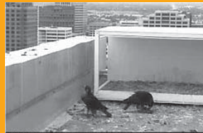
SJ City Hall 2008-05-31 07:54:36